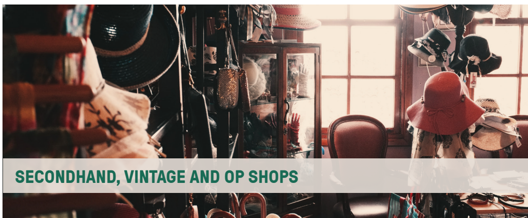
SECONDHAND, VINTAGE AND OP SHOPS