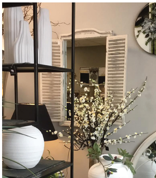
GIFTS, HOMEWARES AND ACCESSORIES