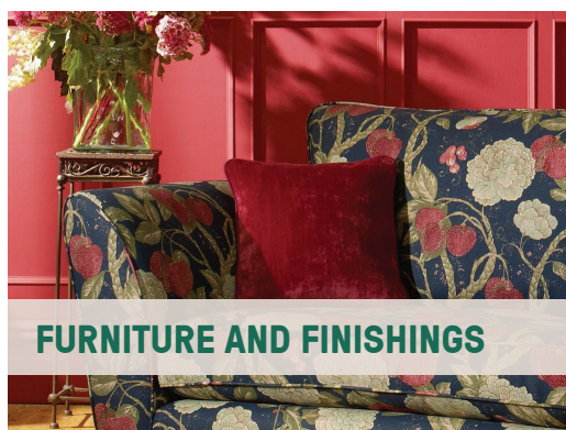
FURNITURE AND FINISHINGS