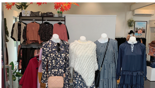
THE LATEST LOOK

Start planning your shopping trip with the Waimakariri Boutique Shopping Guide at www.visitwaimakariri.co.nz .